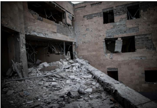
Fig. 3. Effects of a Smerch Artillery Rocket Strike on the Maternity Ward of the Republican Hospital in Stepanakert, 2020

The nature of weaponry employed by the adversary stands as a crucial factor. Understanding the arsenal of military resources at the opponent's disposal allows for predictions regarding the potential minimum and maximum impact of their means. Each weapon category possesses distinct characteristics, causing specific forms of damage and impact [9].