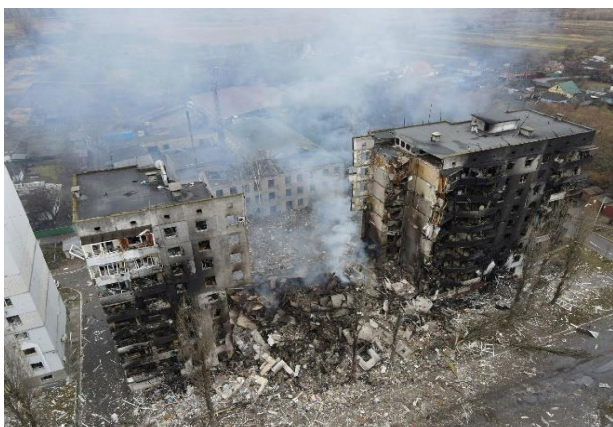
Fig. 4. A residential building destroyed by shelling in Borodyanka, 2022

During spatial planning, it's crucial to consider the positioning of residential buildings, structures, and infrastructures concerning strategic targets. This is because during military operations, hitting a target may cause damage to adjacent buildings of varying importance simultaneously. Special attention should be given to the military resistance of residential and public buildings located near potential military targets, ensuring a safe distance between them.