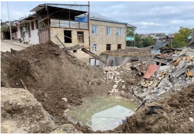
Fig. 2. The impact crater in a residential neighborhood in Stepanakert, Sasountsi David Street after aircraft attack, 2020, photo source: Human Rights Watch

The analysis of military-geographic characteristics of settlements and the implementation of military resistance measures will serve as a basis for the development of various military theories, and the creation of spatial environments adapted for the use of special military equipment and weapons for combat operations [1].