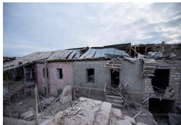
Fig. 5. Residential houses after shelling, Artsakh 2020