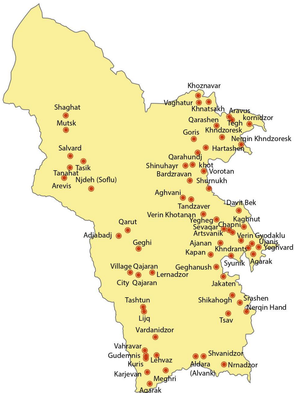
Fig. 1. Map of Border Settlements in the Syunik Region of Armenia

Taking the Syunik Region as an example, it is noteworthy that the main settlements within the region are border settlements located within Zones a) (Fig.1).